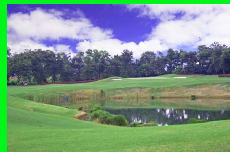
Emeralda Golf Club

* Enjoy Jakarta World Junior Golf Championships - EJWJGC 2012 *