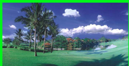
Damai Indah Golf Pantai Indah Kapuk

* Enjoy Jakarta World Junior Golf Championships - EJWJGC 2012 *