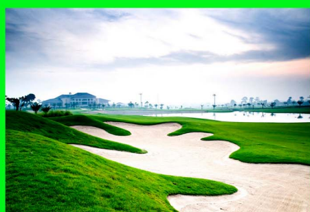
Royale Jakarta Golf Club