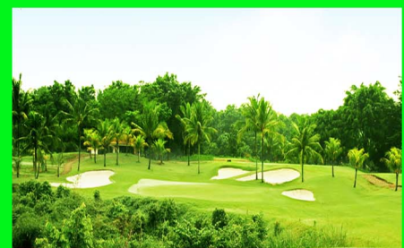
Riverside Golf Club