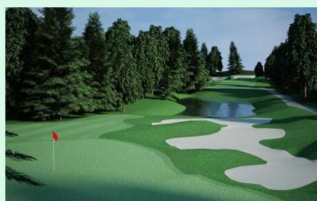
Senayan National Golf Club

Grand Whiz 3* : start from USD 535/pax Best Western 3* : start from USD 545/pax Novotel 4* : start from USD 605/pax JS Luwansa 4* : start from USD 635/pax The Park Lane 4* : start from USD 630/pax The Sultan 5* : start from USD 655/pax ( formerly Hilton Hotel ) Mulia Senayan 5* : start from USD 840/pax Kempinski 5* : start from USD 930/pax ( a.k.a Hotel Indonesia )