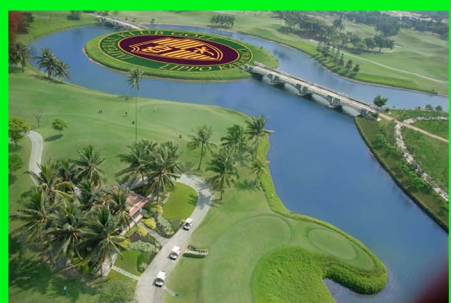
Imperial Golf Club