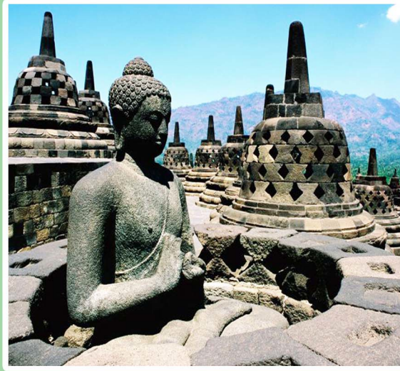
Borobudur Temple One of the world seven wonder

Acommodation, transport by minivan, Guide assistance - English Speaking, Green Fee, Caddy Fee, Sharing Buggy Fee