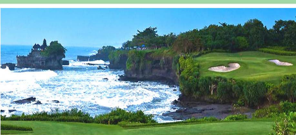
NIRWANA BALI GOLF

Designed and built by Nyoman Nuarta, one of Indonesia's foremost modern sculptor, the Garuda Wisnu Kencana statue or GWK and its pedestal building will be standing 150 meters tall with its wings span 64 meters across. The statue and its pedestal will be surrounded by more than 240 hectares cultural park which was once an abandoned and unproductive limestone quarry. The statue of Wisnu is an illustration of the Almighty God in maintaining and caring all life and its being. The god Wisnu is the owner of Amerta in the form of water as the source of fertility, giving wealth and life to the universe.