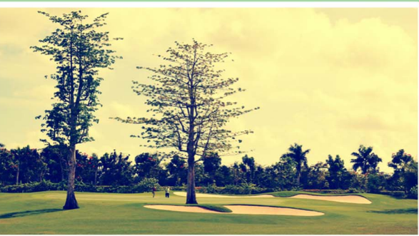
NEW KUTA GOLF