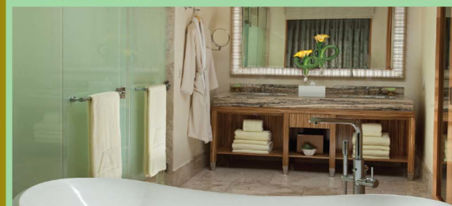
MULIA RESORT - MULIA GRANDEUR

Exclusivity and luxurious interplay with the first designated purity reserve in the world. Featuring superbly design rooms, suites, including lagoon suites, the recreation on Mulia Resorts abounds the pace is up to you to discover the chic of this luxury getaway. Savor sumptuous living from boudoir to patio and be impressed by accommodating chambers – the largest discovered on the island. Distinguished by stylish scenic grandeur classes, these rooms are abodes for romantic retreats